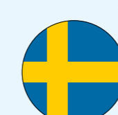
Jessika Roswall Minister for EU Affairs Sweden