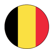
Hadja Lahbib Minister of Foreign Affairs, European Affairs and Foreign Trade and the Federal Cultural Institutions Belgium