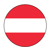
Karoline Edtstadler Minister for the EU and Constitution Austria