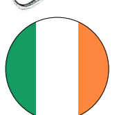
Jennifer Carroll MacNeill Minister of State for European Affairs & Defence Ireland