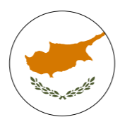
Marilena Raoua Deputy Minister for European Affairs Cyprus