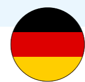
Anna Lührmann Minister of State for Europe Germany