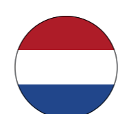
Hanke Bruins Slot Minister of Foreign Affairs Netherlands