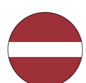
Baiba Braže Minister for Foreign Affairs Latvia