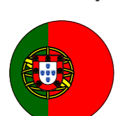
Inês Domingos Secretary of State for European Affairs Portugal